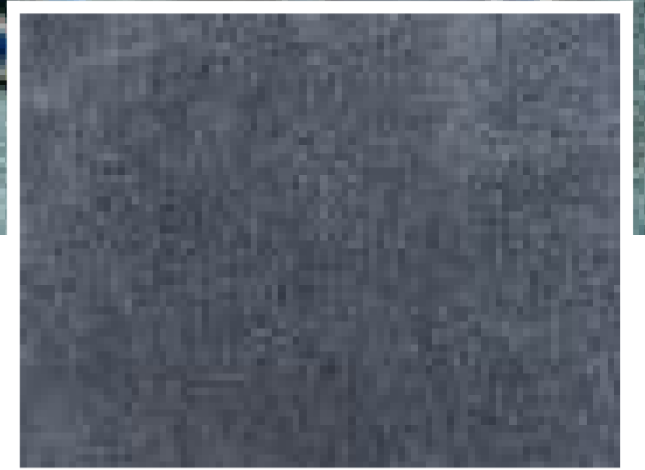
3112 DARK BLUE