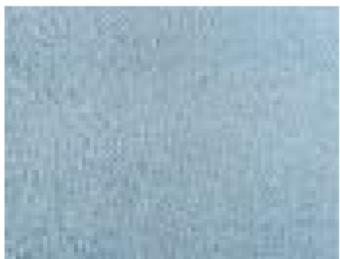
2611 SKY BLUE