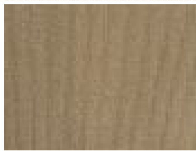
329 LGHT BROWN