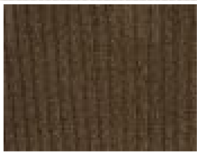
321 DARK BROWN