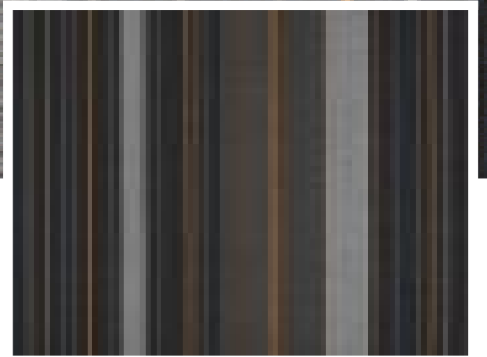
4645 BLACK FOREST