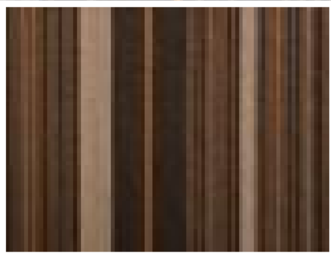
4624 AMBER BROWN