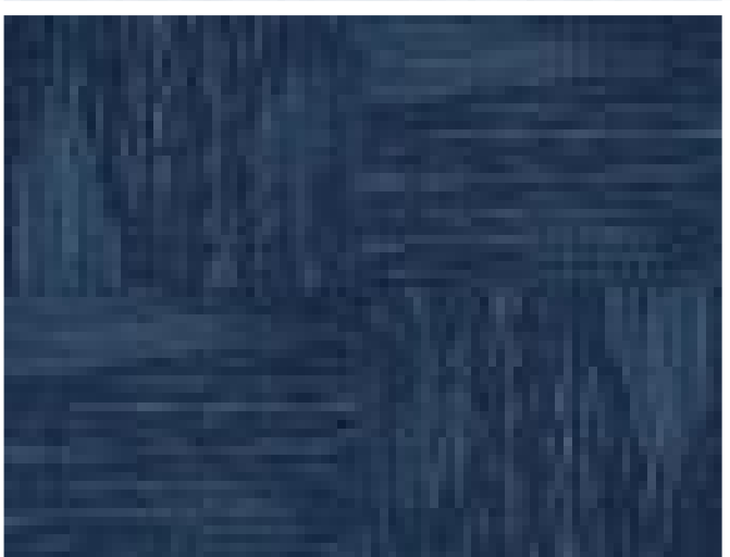
RI 13 BLUE